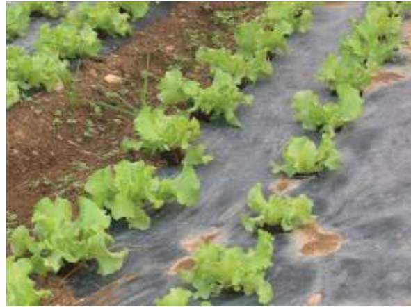
Biorem methodology in greenhouse