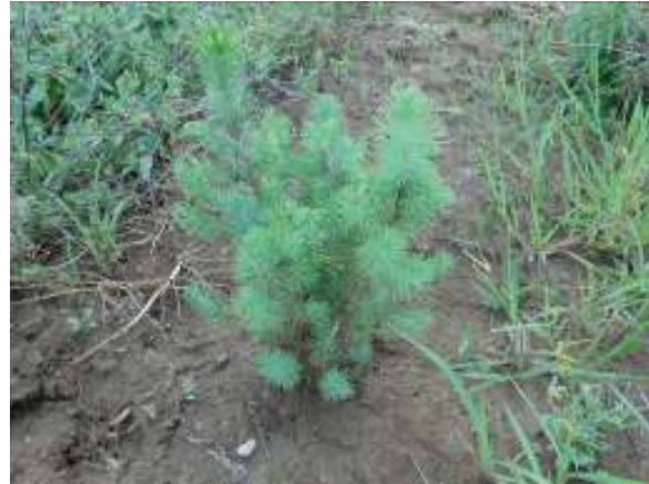
Pistachia and Pinus plants