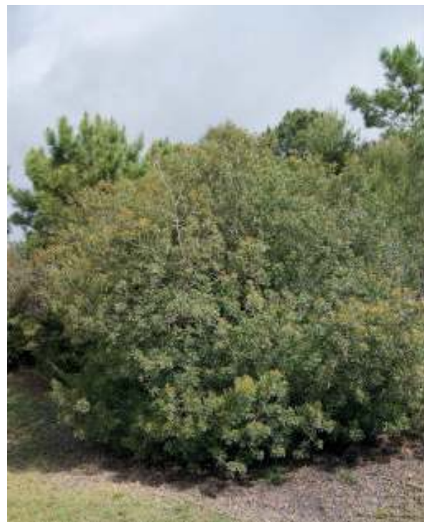
Pinus halepensis and Pistacia lentiscus