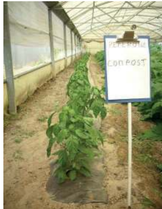
Biorem methodology in greenhouse